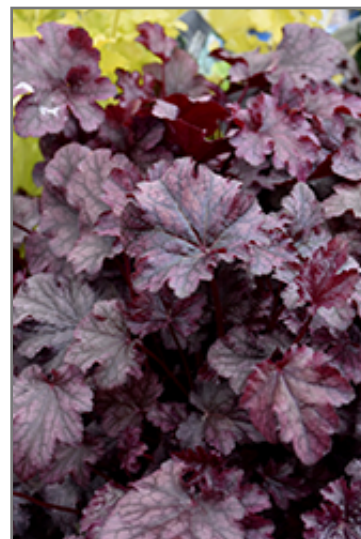
Plum Pudding Coral Bells foliage

Plum Pudding Coral Bells is recommended for the following landscape applications;