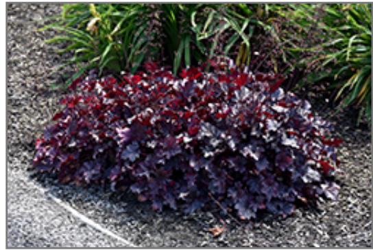
Plum Pudding Coral Bells

Plum Pudding Coral Bells will grow to be only 6 inches tall at maturity extending to 12 inches tall with the flowers, with a spread of 12 inches. When grown in masses or used as a bedding plant, individual plants should be spaced approximately 10 inches apart. Its foliage tends to remain low and dense right to the ground. It grows at a medium rate, and under ideal conditions can be expected to live for approximately 10 years. As an evergreen perennial, this plant will typically keep its form and foliage year-round.