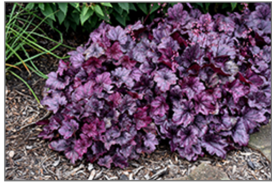
Wild Rose Coral Bells

This is a relatively low maintenance plant, and should be cut back in late fall in preparation for winter. It is a good choice for attracting hummingbirds to your yard. It has no significant negative characteristics.