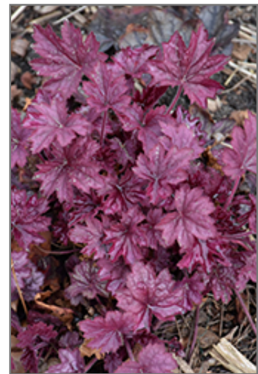
Wild Rose Coral Bells foliage