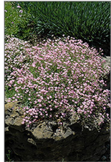
Pink Creeping Baby's Breath in bloom