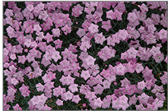
Bath's Pink Pinks in bloom

Bath's Pink Pinks is recommended for the following landscape applications;