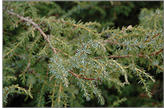
Common Juniper foliage