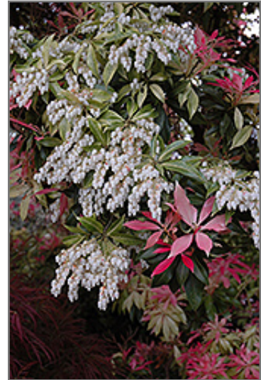
Valley Fire Japanese Pieris flowers

Valley Fire Japanese Pieris is recommended for the following landscape applications;