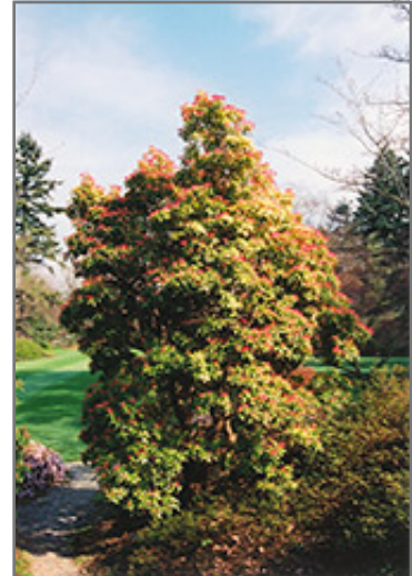
Valley Fire Japanese Pieris

This shrub does best in full sun to partial shade. It requires an evenly moist well-drained soil for optimal growth, but will die in standing water. It is very fussy about its soil conditions and must have rich, acidic soils to ensure success, and is subject to chlorosis (yellowing) of the foliage in alkaline soils. It is somewhat tolerant of urban pollution, and will benefit from being planted in a relatively sheltered location. Consider applying a thick mulch around the root zone in winter to protect it in exposed locations or colder microclimates. This is a selected variety of a species not originally from North America, and parts of it are known to be toxic to humans and animals, so care should be exercised in planting it around children and pets.