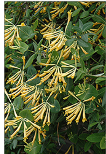
John Clayton Trumpet Honeysuckle flowers