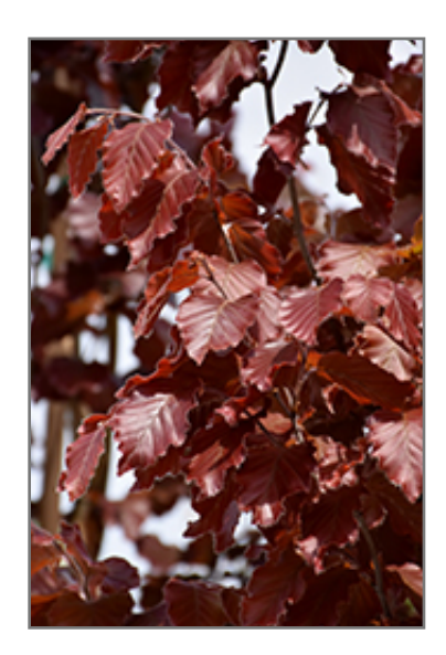
Red Obelisk Beech foliage