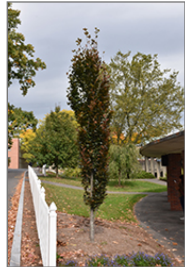
Dawyck Purple Beech