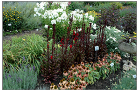
Vulcan Red Lobelia in bloom