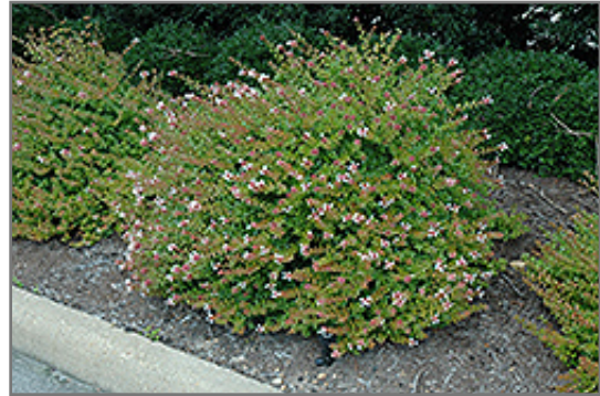
Rose Creek Abelia in bloom

Rose Creek Abelia is recommended for the following landscape applications;