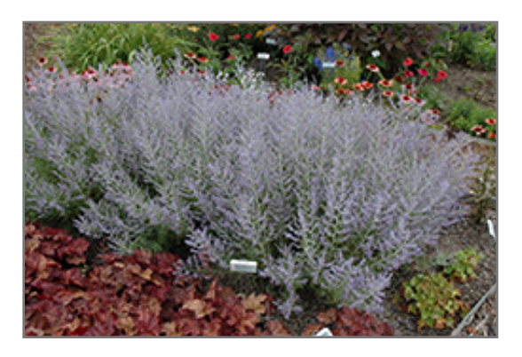
Peek-A-Blue Russian Sage in bloom

Peek-A-Blue Russian Sage is recommended for the following landscape applications;