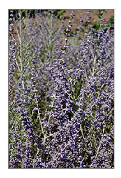
Peek-A-Blue Russian Sage flowers