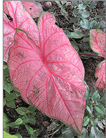
Fannie Munson Caladium foliage

Fannie Munson Caladium is recommended for the following landscape applications;