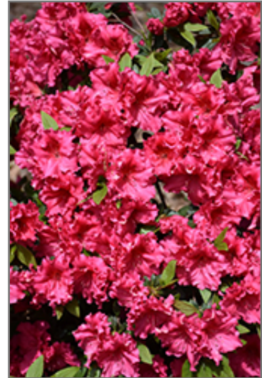
Red Ruffles Azalea flowers