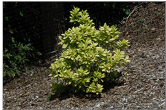
Florida Sunshine Anise