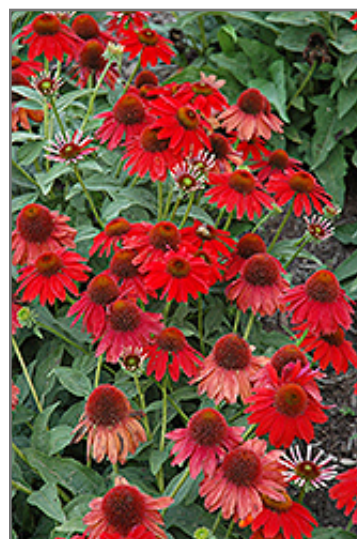
Sombrero Salsa Red Coneflower flowers

Sombrero Salsa Red Coneflower is recommended for the following landscape applications;