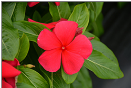
Titan Dark Red Vinca flowers

Titan Dark Red Vinca is recommended for the following landscape applications;