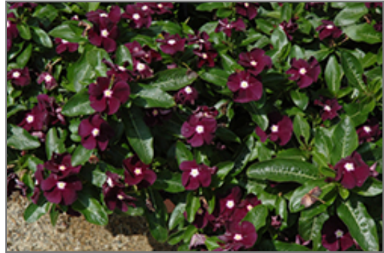
Jams 'N Jellies Blackberry Vinca flowers

Jams 'N Jellies Blackberry Vinca is recommended for the following landscape applications;