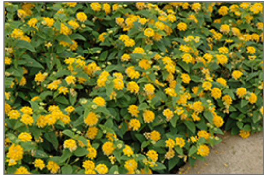
Little Lucky Pot Of Gold Lantana flowers