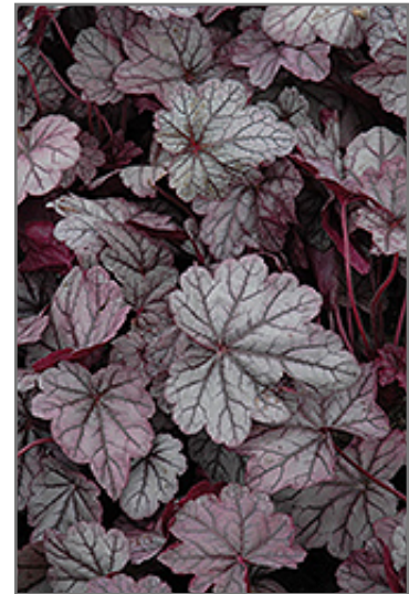
Carnival Sugar Plum Coral Bells foliage

This is a relatively low maintenance plant, and should be cut back in late fall in preparation for winter. It is a good choice for attracting hummingbirds to your yard. It has no significant negative characteristics.