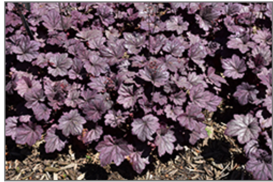
Carnival Sugar Plum Coral Bells

Carnival Sugar Plum Coral Bells will grow to be about 12 inches tall at maturity extending to 18 inches tall with the flowers, with a spread of 14 inches. When grown in masses or used as a bedding plant, individual plants should be spaced approximately 10 inches apart. Its foliage tends to remain dense right to the ground, not requiring facer plants in front. It grows at a medium rate, and under ideal conditions can be expected to live for approximately 10 years. As an evergreen perennial, this plant will typically keep its form and foliage year-round.