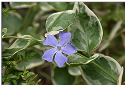
Variegated Periwinkle flowers