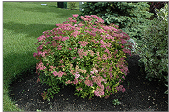
Goldflame Spirea in bloom