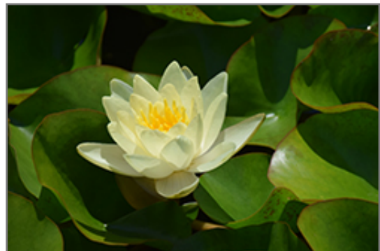
Marliacea Chromatella Hardy Water Lily flowers