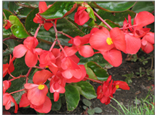
Dragon Wing Red Begonia flowers

Dragon Wing Red Begonia is an herbaceous annual with a trailing habit of growth, eventually spilling over the edges of hanging baskets and containers. Its medium texture blends into the garden, but can always be balanced by a couple of finer or coarser plants for an effective composition.