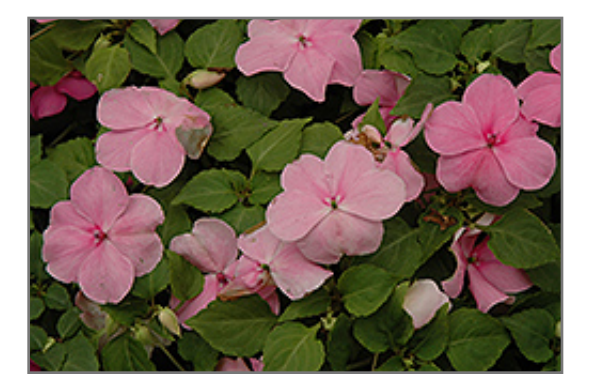
Super Elfin Deep Pink Impatiens flowers