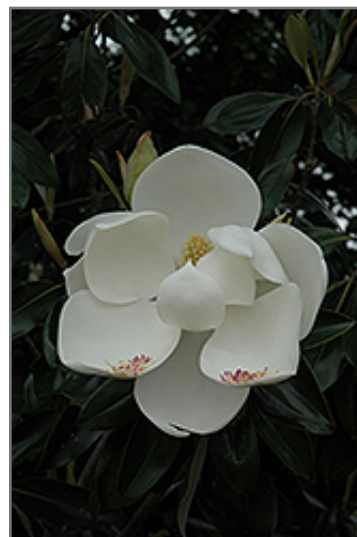
Teddy Bear Magnolia flowers