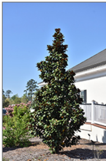
Teddy Bear Magnolia