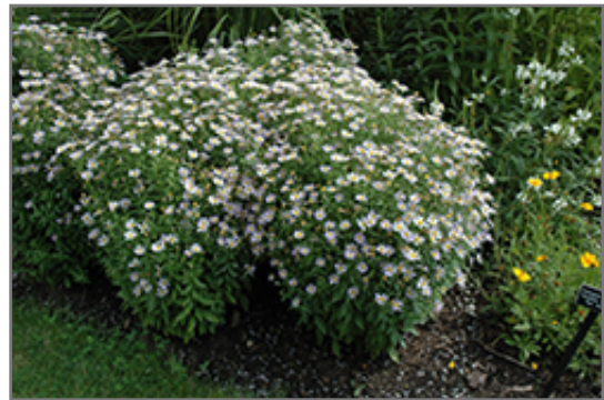
Blue Star Japanese Aster in bloom