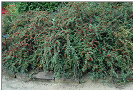
Cranberry Cotoneaster