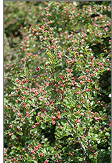
Cranberry Cotoneaster flowers

This shrub does best in full sun to partial shade. It is very adaptable to both dry and moist growing conditions, but will not tolerate any standing water. It is not particular as to soil type or pH, and is able to handle environmental salt. It is highly tolerant of urban pollution and will even thrive in inner city environments. This species is not originally from North America.