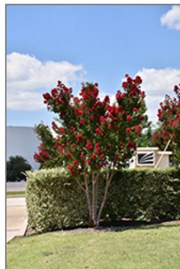
Dynamite Crapemyrtle in bloom