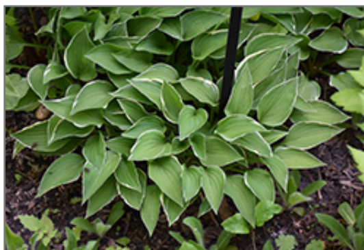
Allan P. McConnell Hosta foliage