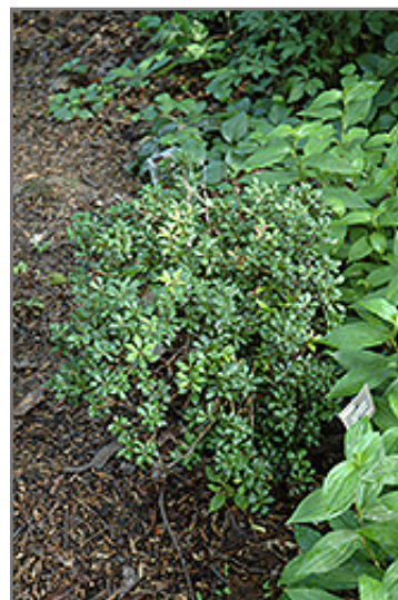
Bisbee Dwarf Japanese Pieris