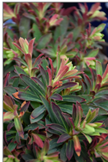
Tiny Tim Spurge flowers