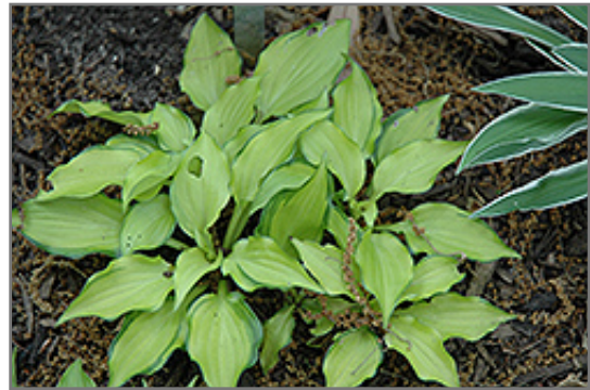
Cracker Crumbs Hosta

Cracker Crumbs Hosta is recommended for the following landscape applications;