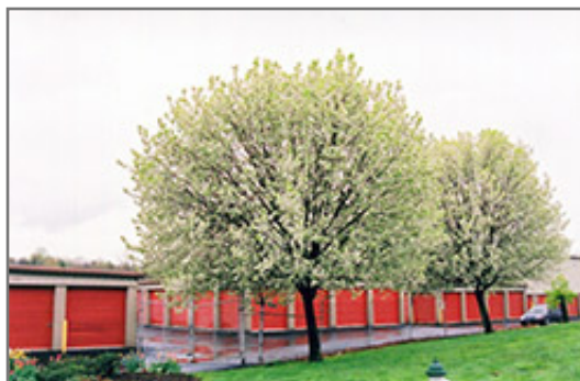
Bradford Ornamental Pear in bloom

Bradford Ornamental Pear is recommended for the following landscape applications;