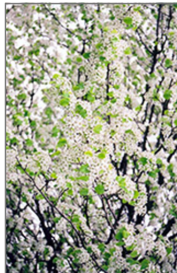
Bradford Ornamental Pear flowers