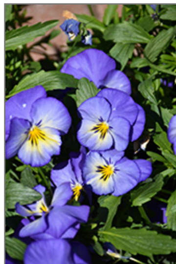
Halo Sky Blue Pansy flowers