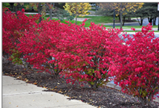
Fire Ball Burning Bush in fall

Fire Ball Burning Bush is recommended for the following landscape applications;