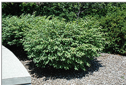
Fire Ball Burning Bush