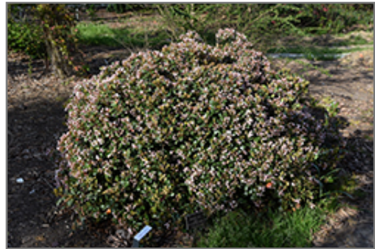
Eleanor Taber Indian Hawthorn in bloom

Eleanor Taber Indian Hawthorn is recommended for the following landscape applications;