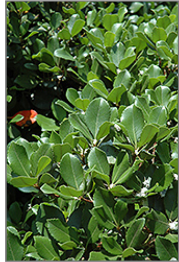
Eleanor Taber Indian Hawthorn foliage

This shrub does best in full sun to partial shade. It prefers to grow in average to moist conditions, and shouldn't be allowed to dry out. It is not particular as to soil type or pH. It is somewhat tolerant of urban pollution. This is a selected variety of a species not originally from North America.