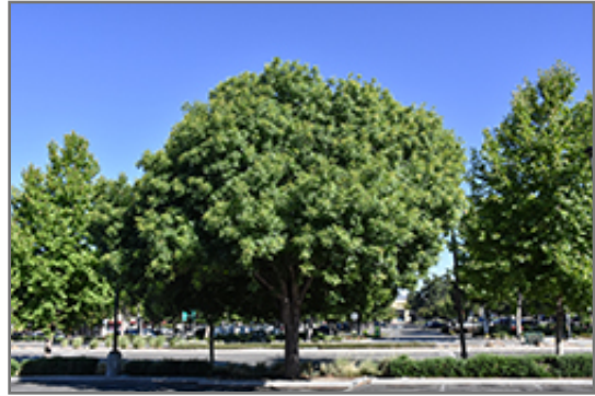
Chinese Pistache