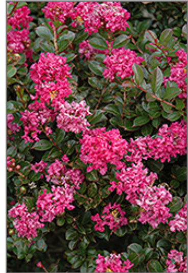
Pocomoke Crapemyrtle flowers

Pocomoke Crapemyrtle is recommended for the following landscape applications;