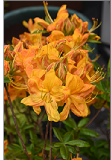
Klondyke Azalea flowers