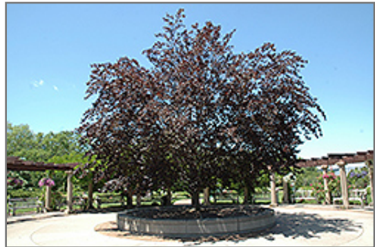
Purple Beech