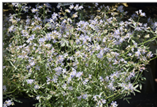
Touch Of Class Jacob's Ladder flowers