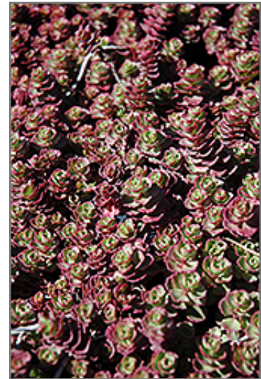
Red Carpet Stonecrop foliage

This plant will require occasional maintenance and upkeep, and is best cleaned up in early spring before it resumes active growth for the season. Deer don't particularly care for this plant and will usually leave it alone in favor of tastier treats. Gardeners should be aware of the following characteristic(s) that may warrant special consideration;