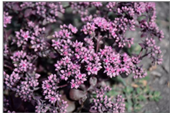
Red Carpet Stonecrop flowers