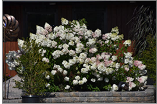
Vanilla Strawberry Hydrangea in bloom

This shrub performs well in both full sun and full shade. It prefers to grow in average to moist conditions, and shouldn't be allowed to dry out. It is not particular as to soil type or pH. It is highly tolerant of urban pollution and will even thrive in inner city environments. Consider applying a thick mulch around the root zone in winter to protect it in exposed locations or colder microclimates. This is a selected variety of a species not originally from North America.