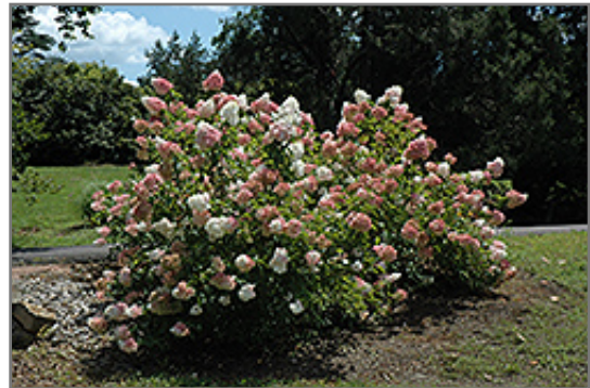
Vanilla Strawberry Hydrangea in bloom