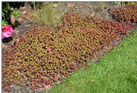
Fulda Glow Stonecrop