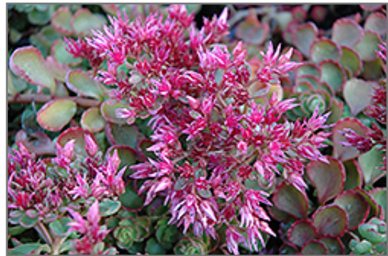
Fulda Glow Stonecrop flowers