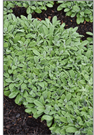
Little Lamb Lamb's Ears

Little Lamb Lamb's Ears is a fine choice for the garden, but it is also a good selection for planting in outdoor pots and containers. It is often used as a 'filler' in the 'spiller-thriller-filler' container combination, providing a mass of flowers and foliage against which the thriller plants stand out. Note that when growing plants in outdoor containers and baskets, they may require more frequent waterings than they would in the yard or garden.