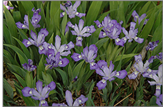
Dwarf Crested Iris flowers