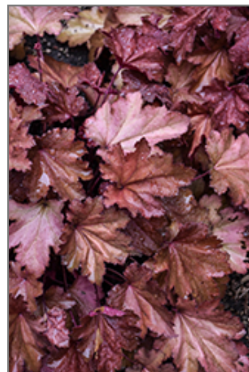
Magma Coral Bells foliage

Magma Coral Bells is recommended for the following landscape applications;