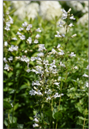
Foxglove Beardtongue flowers

Foxglove Beardtongue is recommended for the following landscape applications;