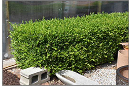
NewGen Independence Boxwood